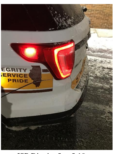
ISP District 5 at 5:19 a.m.

The public is reminded that all persons are presumed innocent until proven guilty in a court of law.